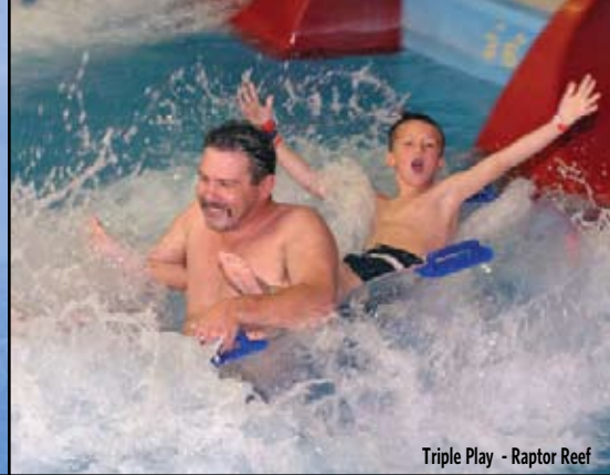
Triple Play - Raptor Reef

Plunge... an adrenaline rush is guaranteed as you speed towards the ground at 47 mph. The newest, tallest and fastest roller coaster, Aftershock , opened in July 2008. Located 15 minutes north of Coeur d'Alene on US Highway 95. 683-3400 or www.silverwoodthemepark.com .