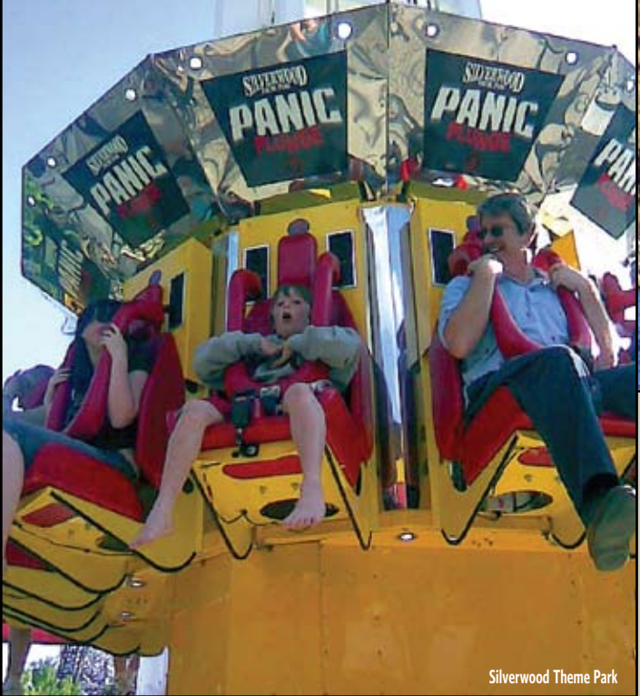
Silverwood Theme Park