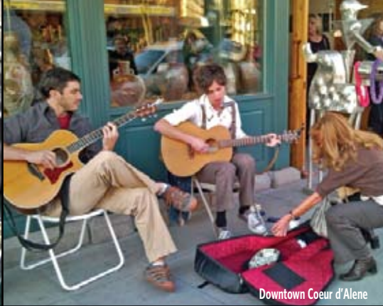
Downtown Coeur d'Alene