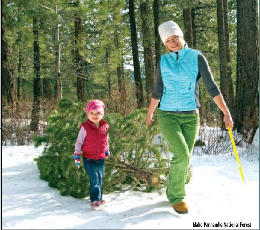
Idaho Panhandle National Forest