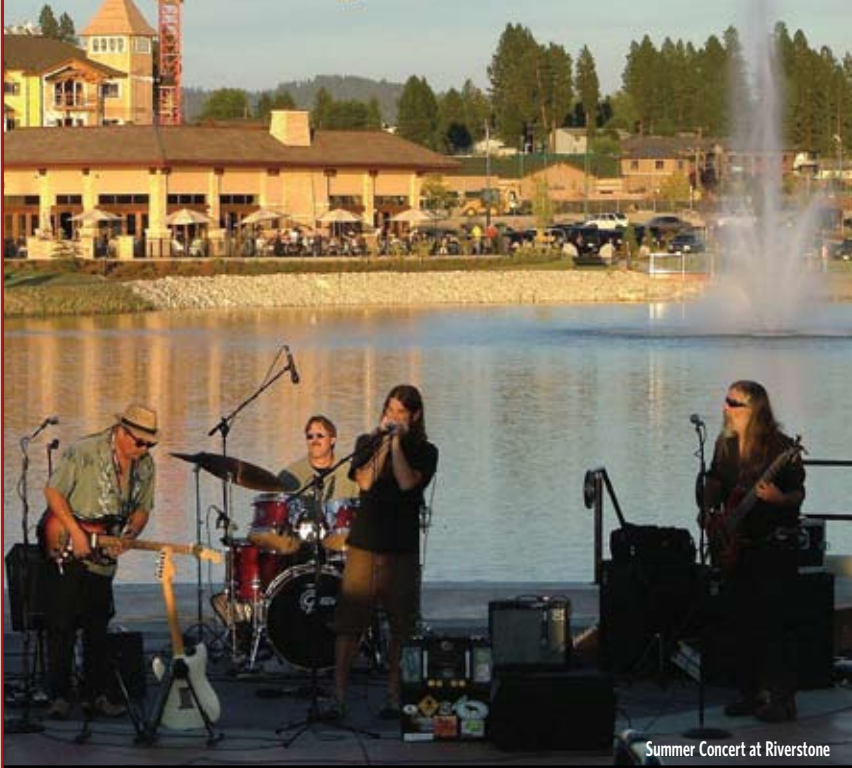
Summer Concert at Riverstone