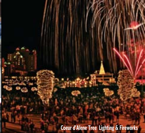
Coeur d'Alene Tree Lighting & Fireworks