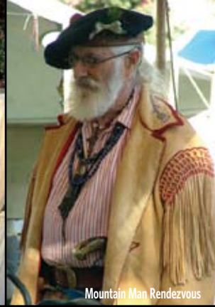
Mountain Man Rendezvous