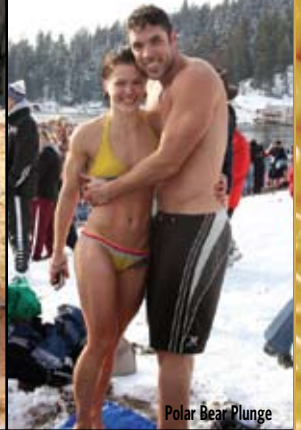
Polar Bear Plunge