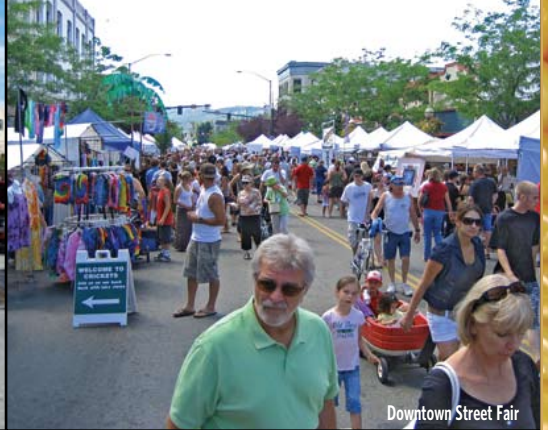
Downtown Street Fair