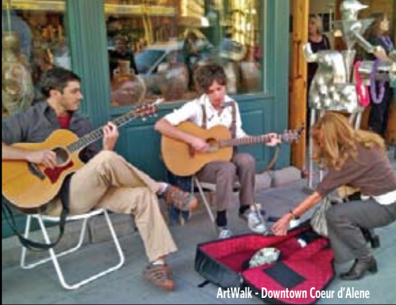
ArtWalk - Downtown Coeur d'Alene