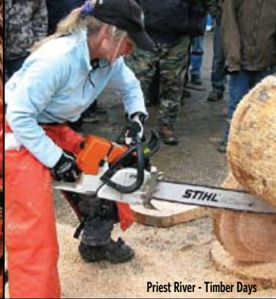
Priest River - Timber Days