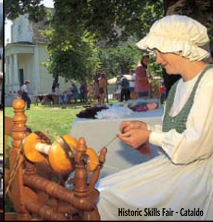
Historic Skills Fair - Cataldo