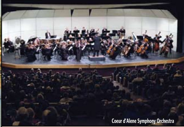
Coeur d'Alene Symphony Orchestra