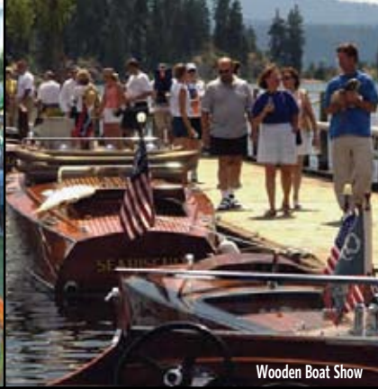
Wooden Boat Show