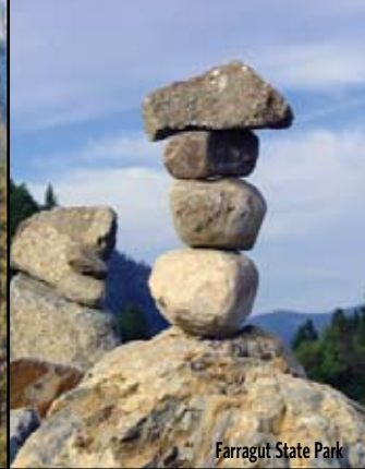
Farragut State Park