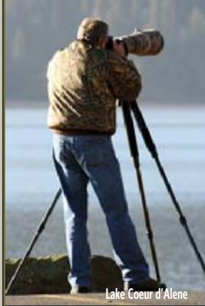
Lake Coeur d'Alene