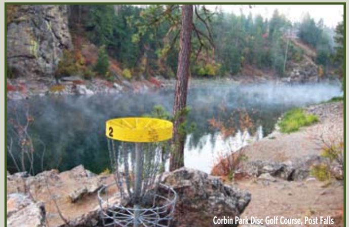
Corbin Park Disc Golf Course, Post Falls