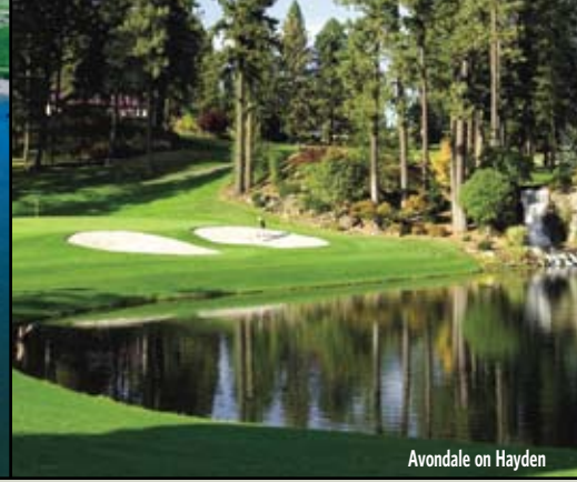
Avondale on Hayden